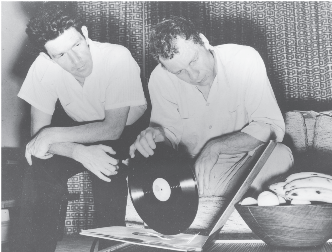
John Cage and Merce Cunningham, Black Mountain College Summer Institute in the Arts, 1953. From the Black Mountain College Research Project Papers, Visual Materials, Box 88, North Carolina State Archives, Raleigh, NC.

Forwarding and Return Postage Guaranteed Address Service Requested