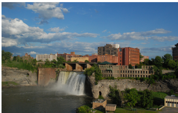
Rochester Falls

The lilacs will be blooming, the wine will be flowing in the Finger Lakes, and the labels will be plentiful at the 46th annual ARSC conference in Rochester, New York. Our local host, the Eastman School of Music, currently employs two ARSC past presidents so we can rest assured that our needs will be well met. Make plans now to attend!